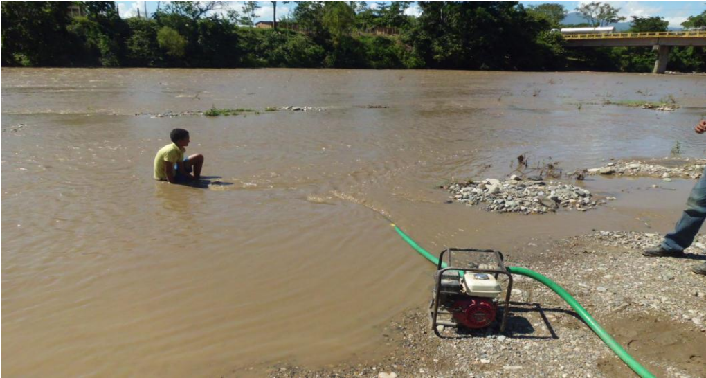
Previous water source depended on by the entire community to meet all of their water needs.