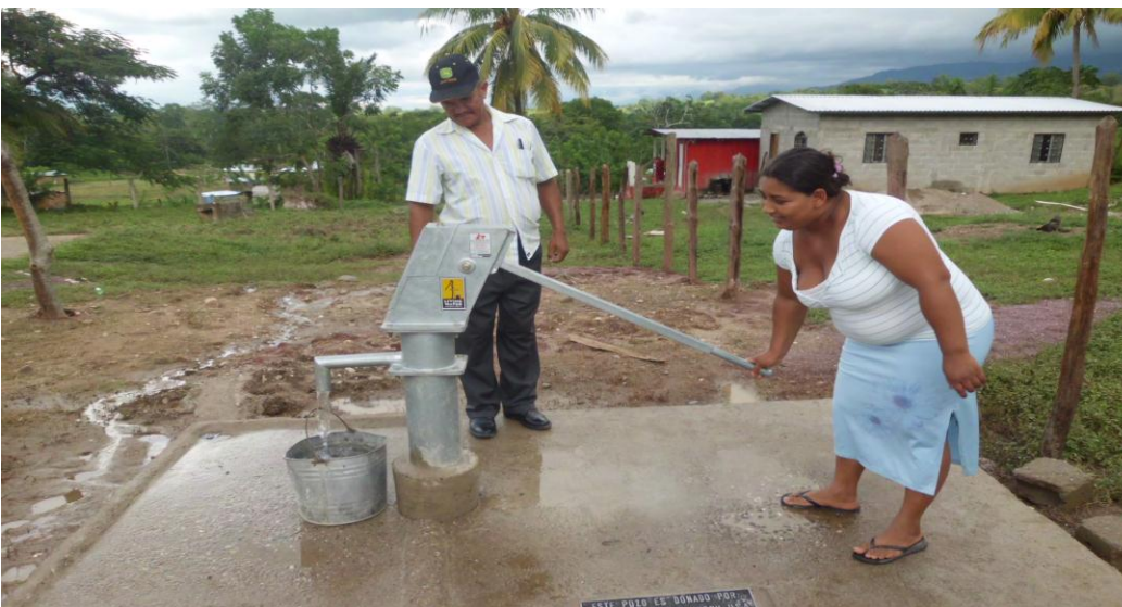
Community members pumping clean, safe drinking water.