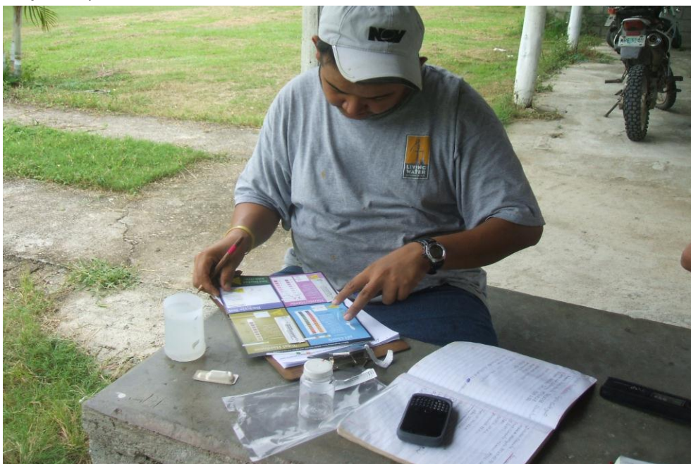
Well chlorination test.