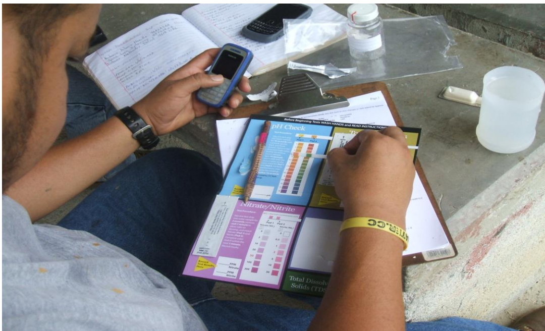
LWI Honduras team testing the well chlorination.