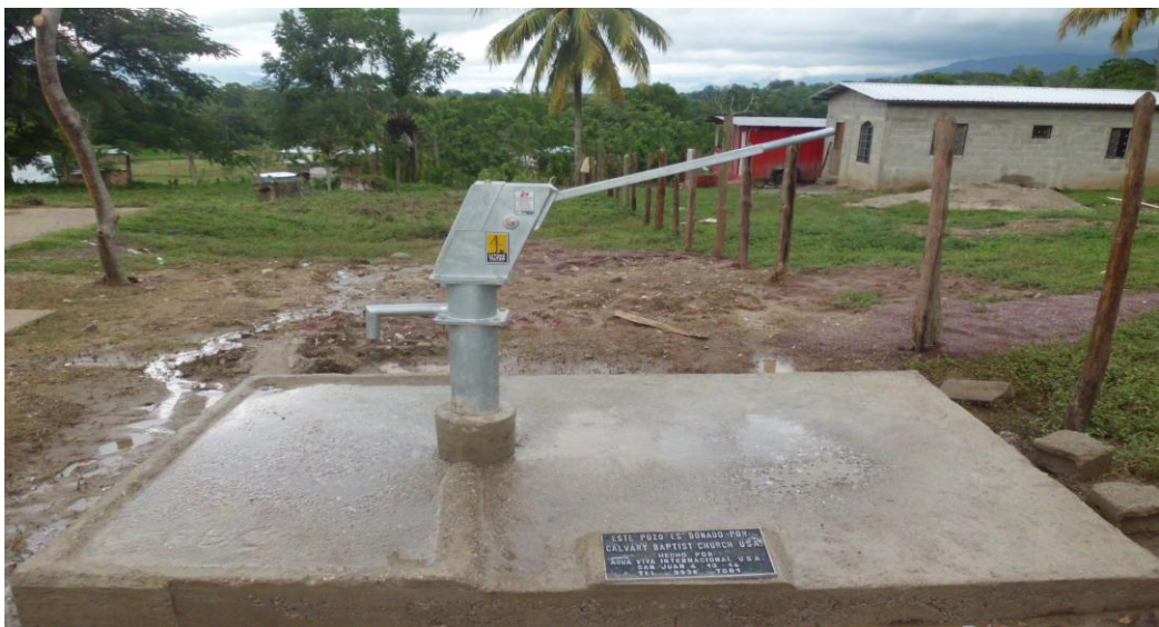
Plaque on pump.