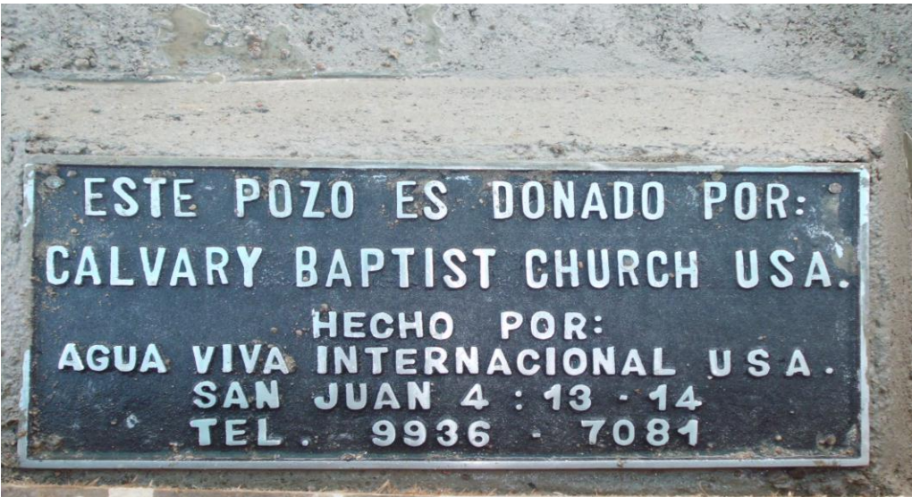
Close up of plaque.