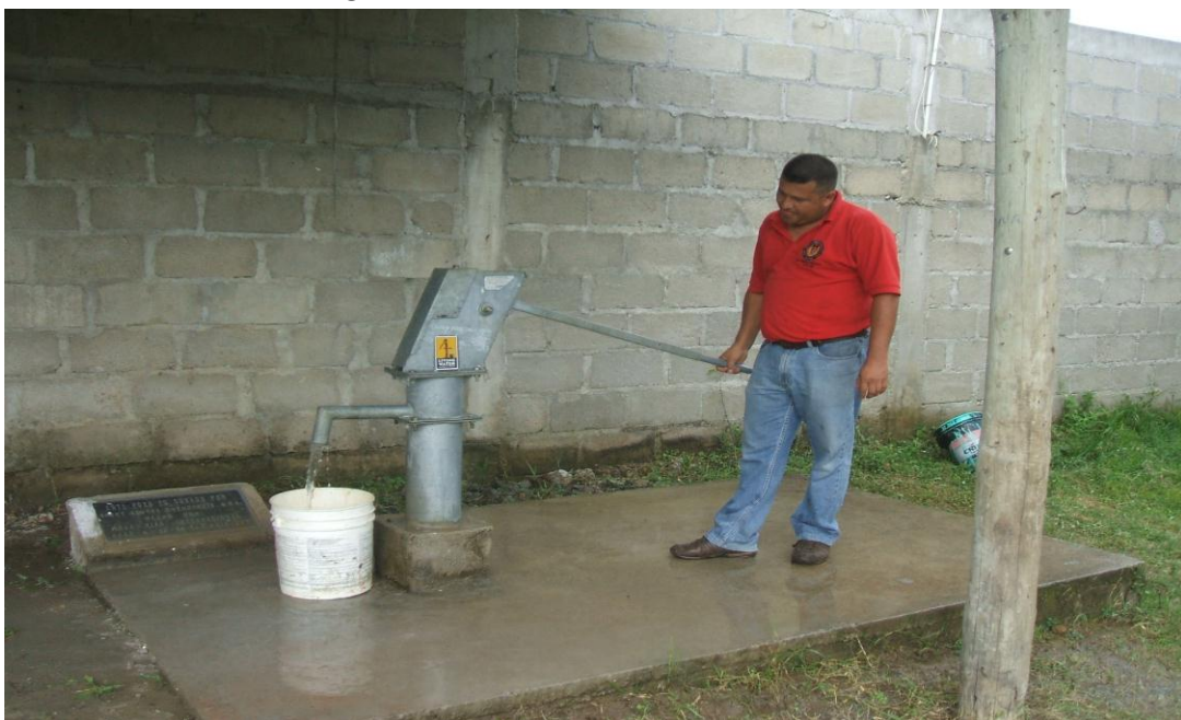
Community member pumping clean, safe drinking water.