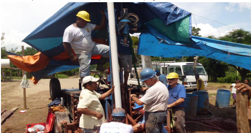
Project in process.