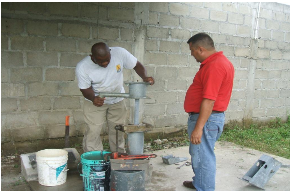
Project in process.