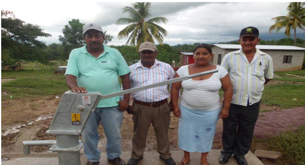
Community members who are responsible for helping maintain the well.